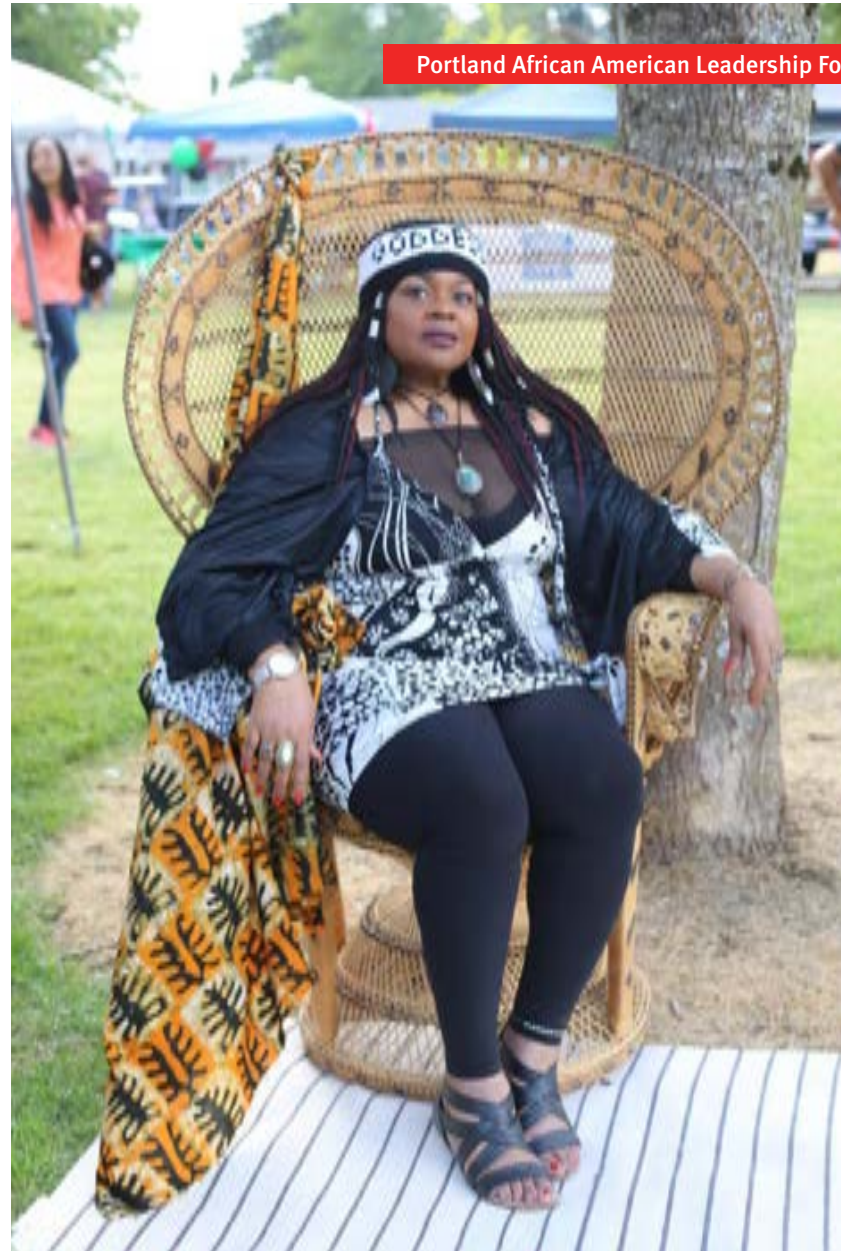
Portland African American Leadership Forum