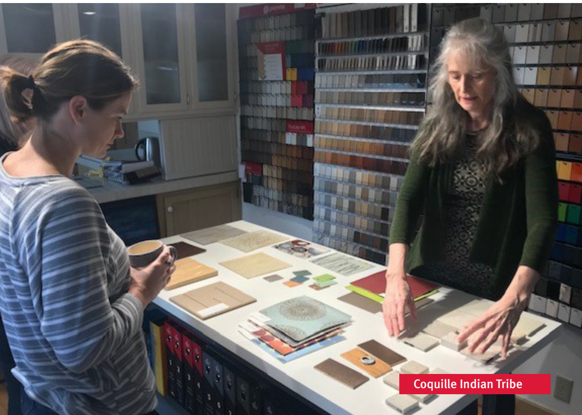
Coquille Indian Tribe